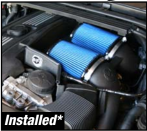
*54-11472 installed on 2008 E90 335i.